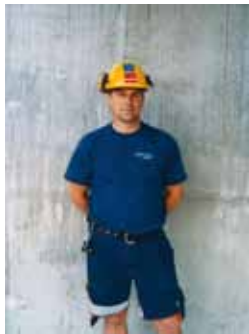
Trawl Codworkers, between 1980s-1990s Rettferdige lønner og rettferdige lønner under myndighetene og rettferdighet Trawl Codworkers, between 1980s-1990s Rettferdige lønner og rettferdige lønner under myndighetene og rettferdighet